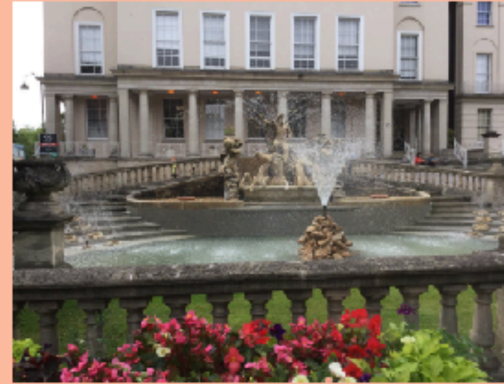
Miniature of Tivoli Fountain