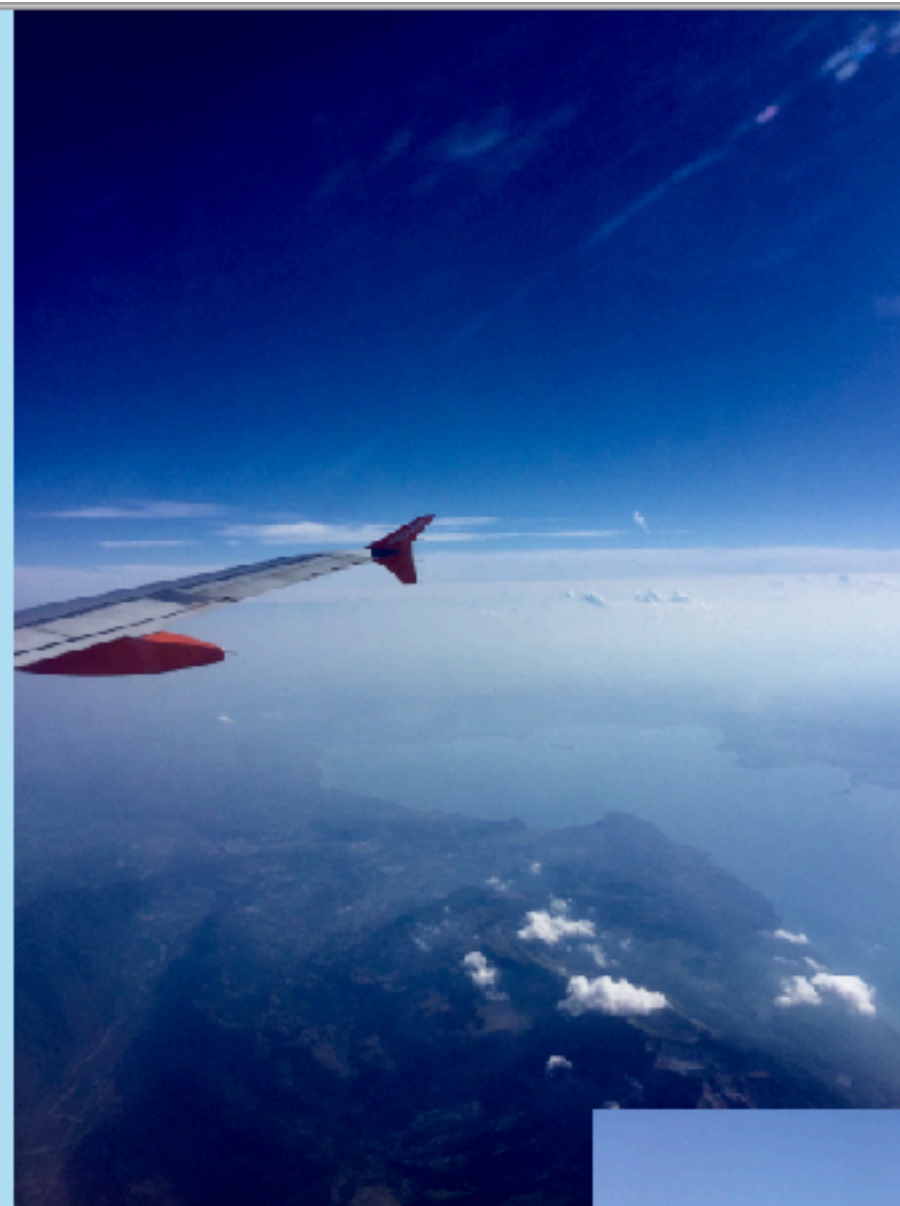
On my way home Lake Garda