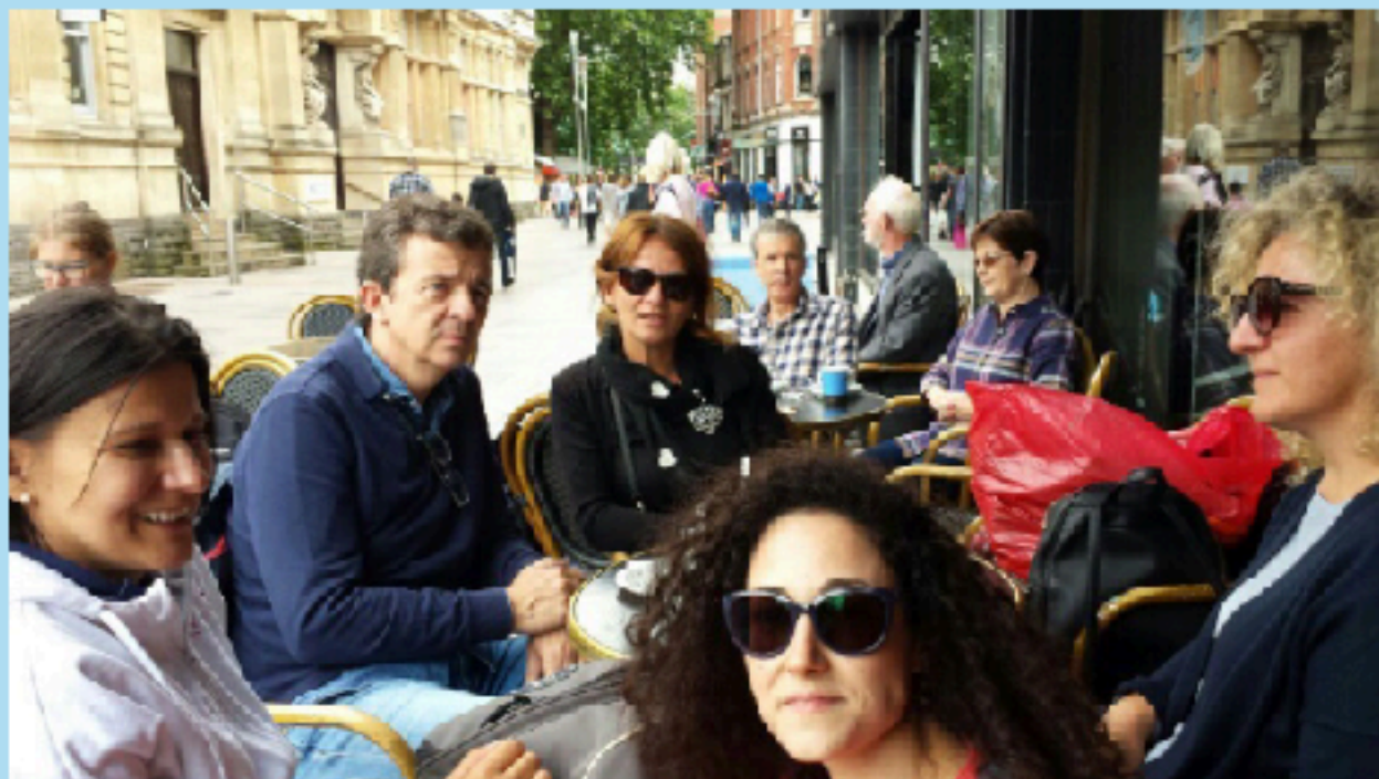
Relaxing In Cardiff