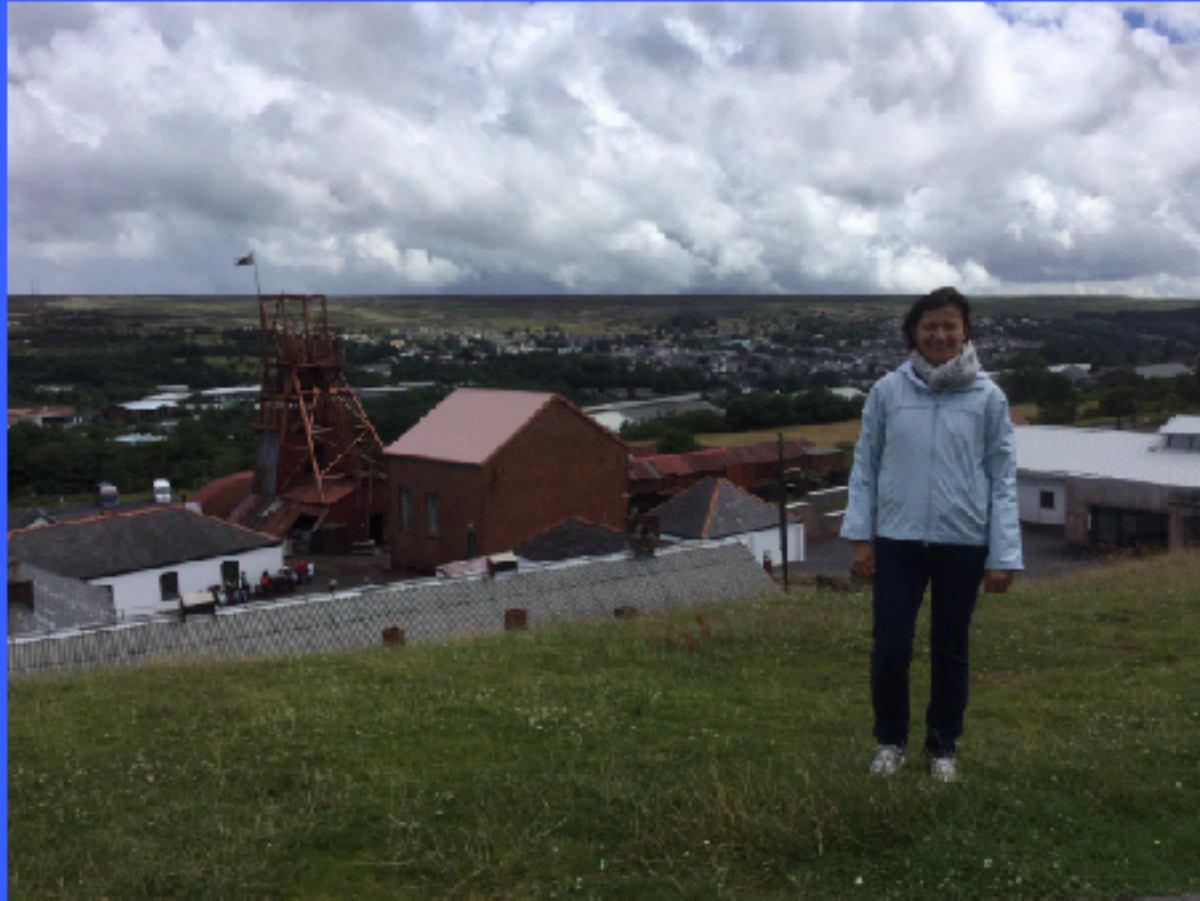
Windy and cold weather