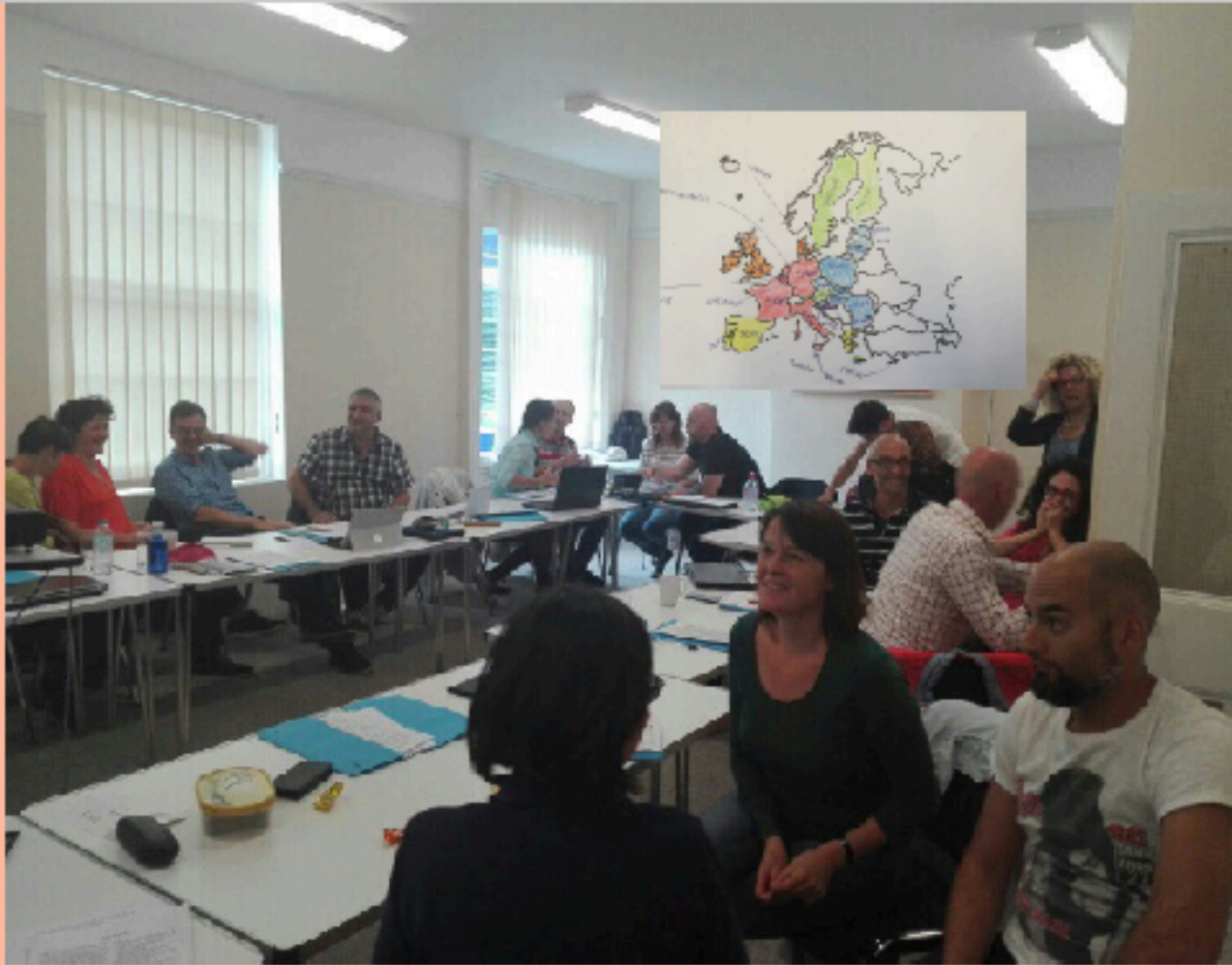
Teachers from all over Europe

Having lunch together in the park and enjoying the sunny day