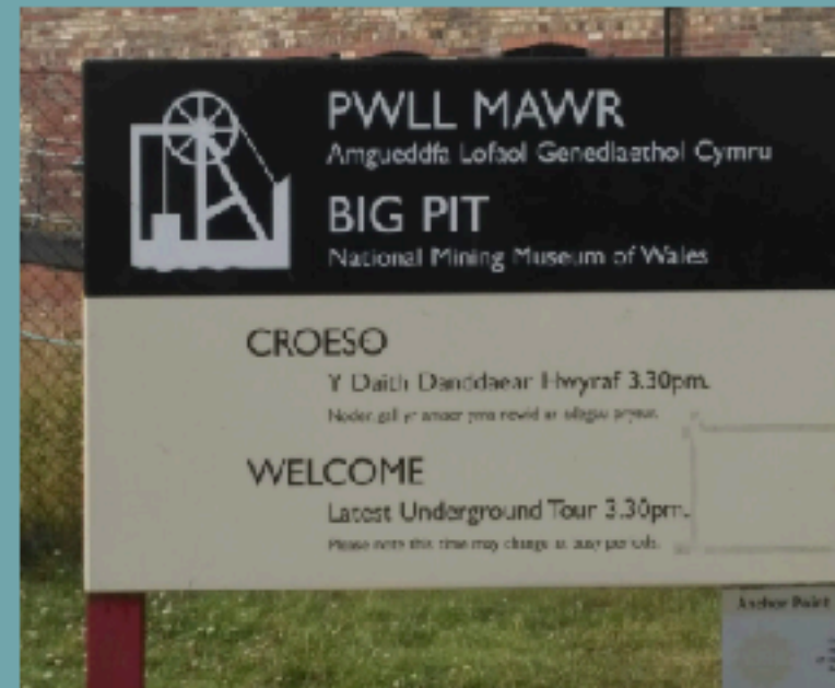
A day trip to the Big Pit in Wales