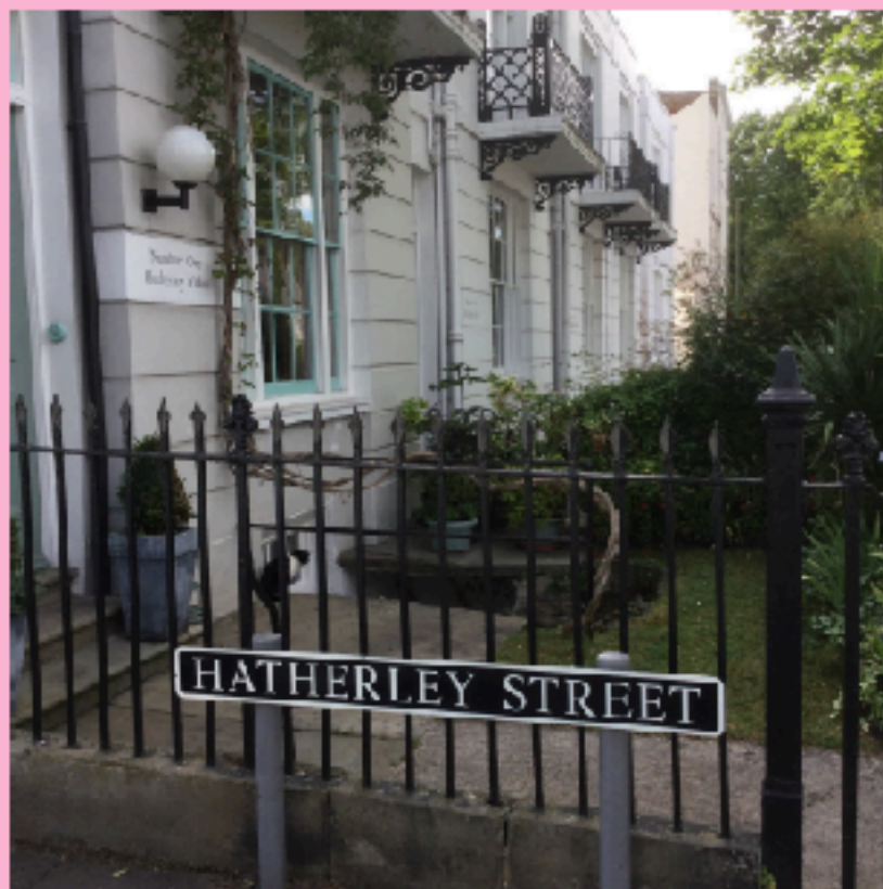
Where I live in Cheltenham