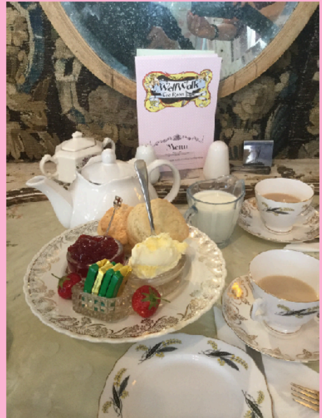
A taste of England: Scones and clotted cream! Yummy!!!