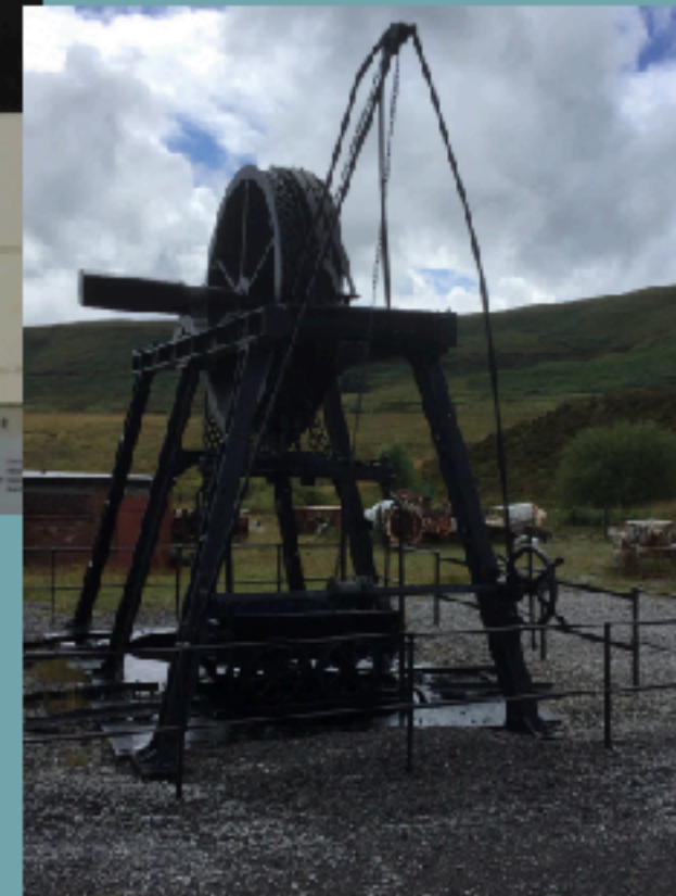
Croeso to Cymru