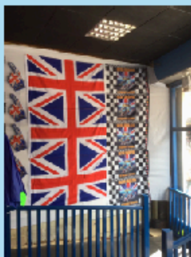
Shopping for souvenirs