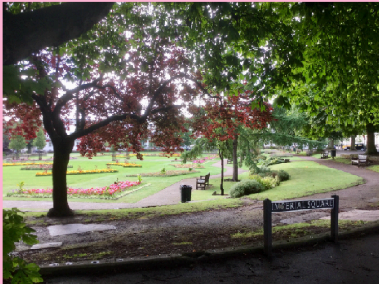
A park on the way to school, in the city centre