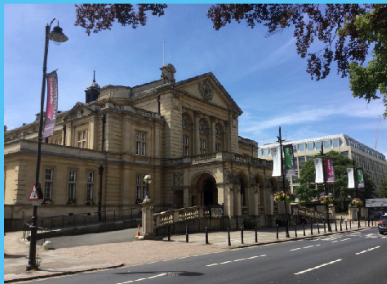
(Cheltenham Old Town Hall)