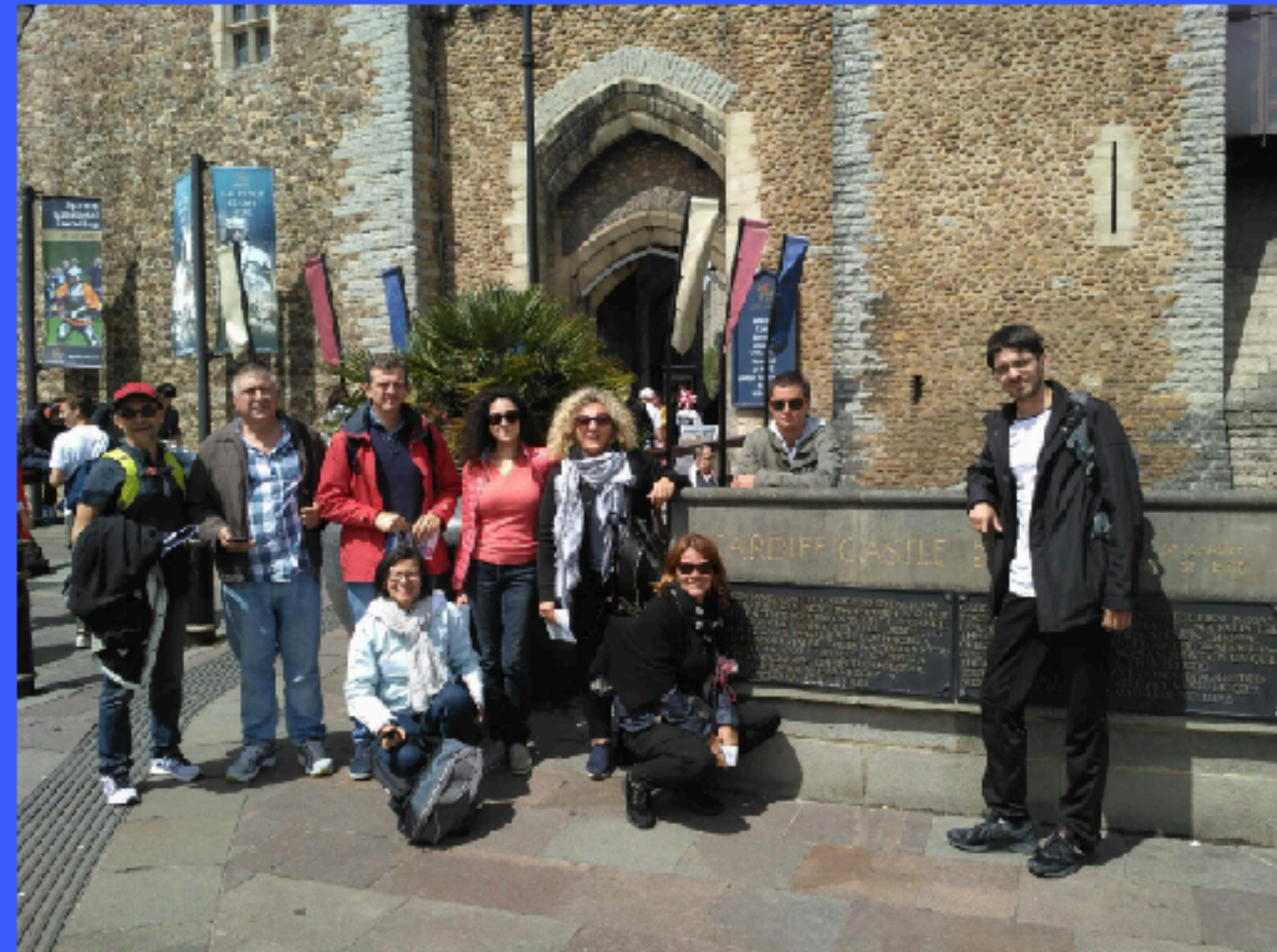
All the group in front of the Castle

After visiting the famous mine, we are ready to drive to Cardiff, the capital city of Wales!