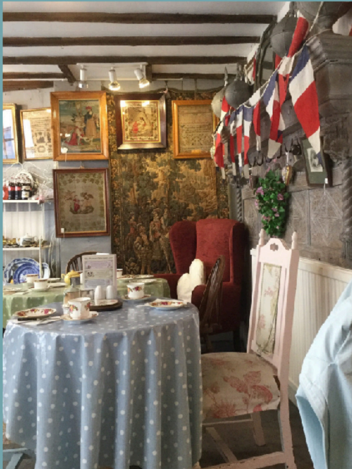
A Typical Tea Room In Cheltenham